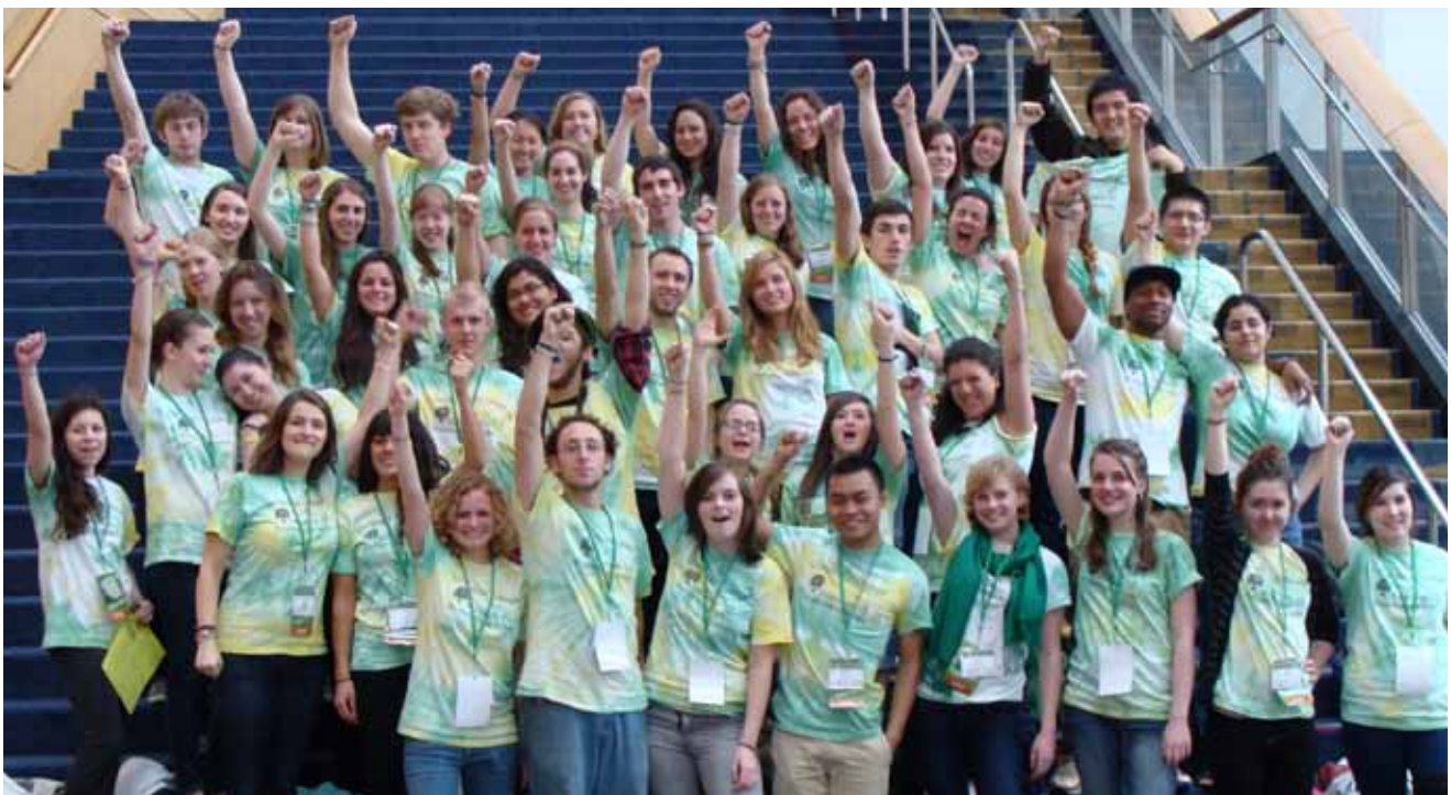
The Connecticut College Power Shift contingent

Ten students, including seven from the Goodwin-Niering Center, thank the center for supporting their attendance at this important event.